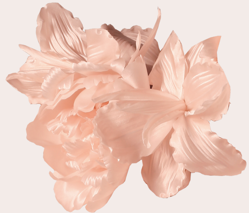
HANDMADE IRIS FLOWER CASCADE