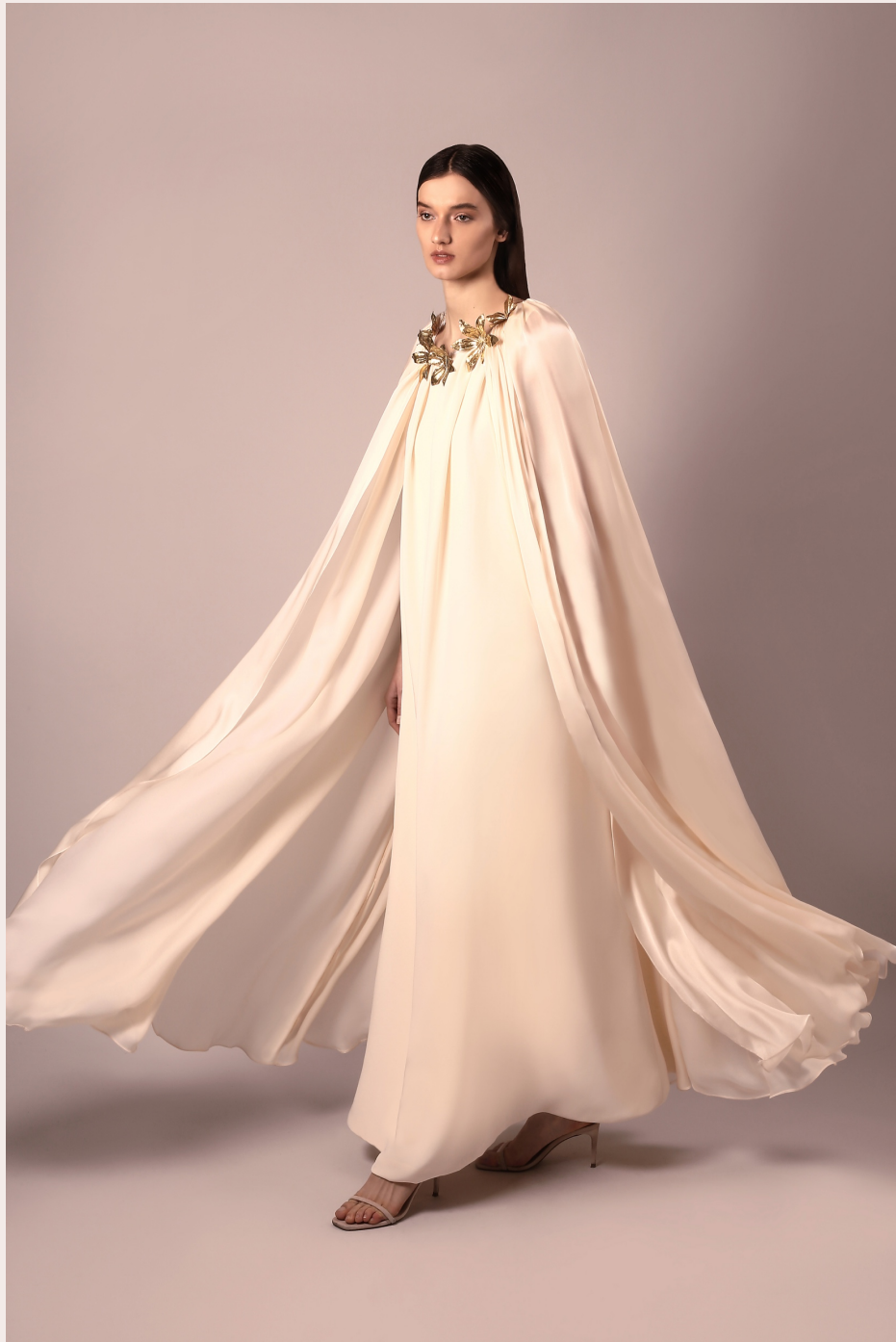
GOLDEN LILY CAFTAN