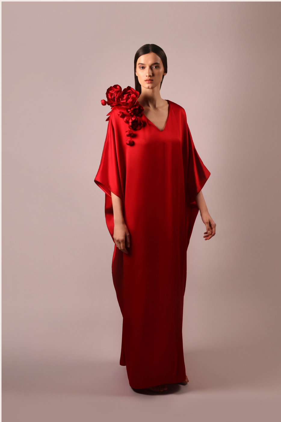
PEONY CASCADE CAFTAN