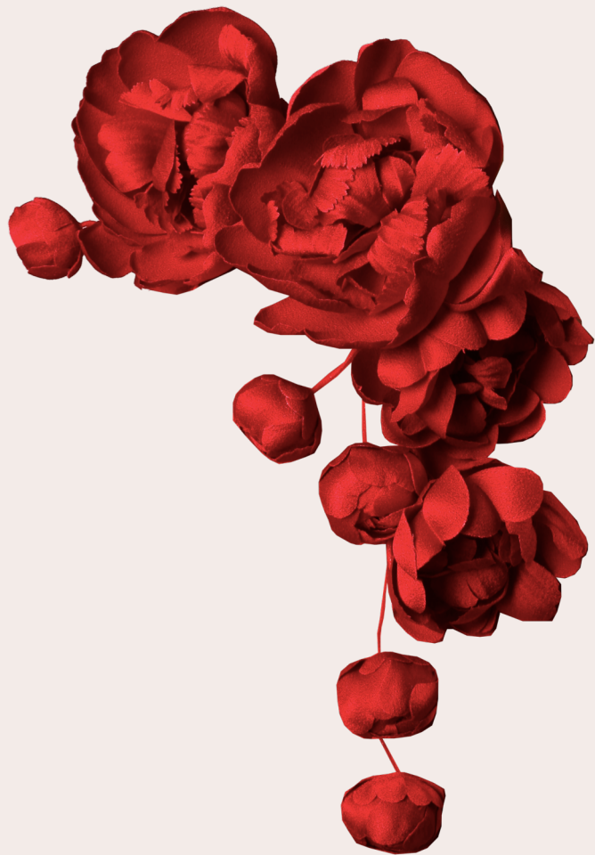
HANDMADE PEONY FLOWER CASCADE