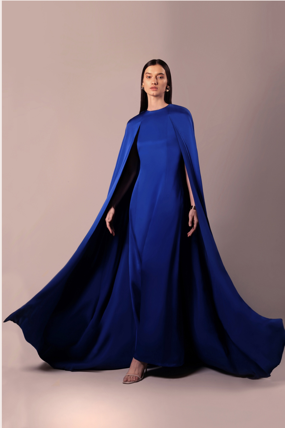
MONA CAPE CAFTAN